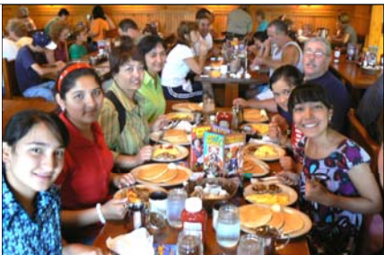
2008 ACR winners from Tajikistan visit the USA!

Contact us by email at: LRose25607@aol.com .