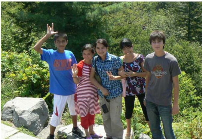
2008 Tajik ACR winners enjoy themselves in the Great Smoky Mountain National Park located near Cherokee, North Carolina

Students and teachers must first register with the ACR Committee by sending an email to: LRose25607@aol.com. After you register, you will receive instructions by email that will guide you through each step of the competition.